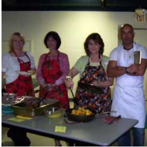
Cheerful servers for FIL