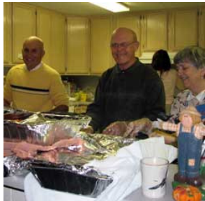
Kitchen crew for the Free International lunch FIL

Prayer. Why not? A Middle Eastern student at the university some days ago was visiting with our coworker. He was distressed and sharing his concerns over the illness of a close family member. Our friend asked if he would like him to pray. The response was 'yes'. So on the spot prayer was offered for the ailing person. A couple days went by and our friend received a call from the student. Further prayer was requested. Fast-forward a few more days. An evening meal outing had been planned at the home of another volunteer. Before the time of the meeting the Middle Eastern student initiated this request, Could we also have prayer at the gathering? This was responded to with compassionate believing friends joining together around the student, asking for God's intervention and presence. Thank you for praying!