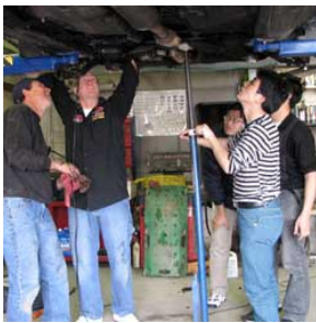
Mechanics help students with their cars

It Takes a TEAM! Sometimes we (personally) are given a lot of credit for the international student ministry. We really do enjoy our roles and feel we're where God has us in helping reach the nations for him. However, we want those of you who don't live near Tulsa to meet a sampling of the folks who are on the ground here with us. May we introduce you (via photo) to a few of our volunteer friends. Without the labor of love of these and others, combined with your loving support, many of the students here in Tulsa would not hear or experience the love of Christ as they do now.