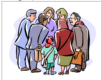
Internationals, no matter what their age or cultural background, want to know about Christianity.

Know that the funds you invest and the intercessory prayers you offer are making a difference in the world at our doorstep!