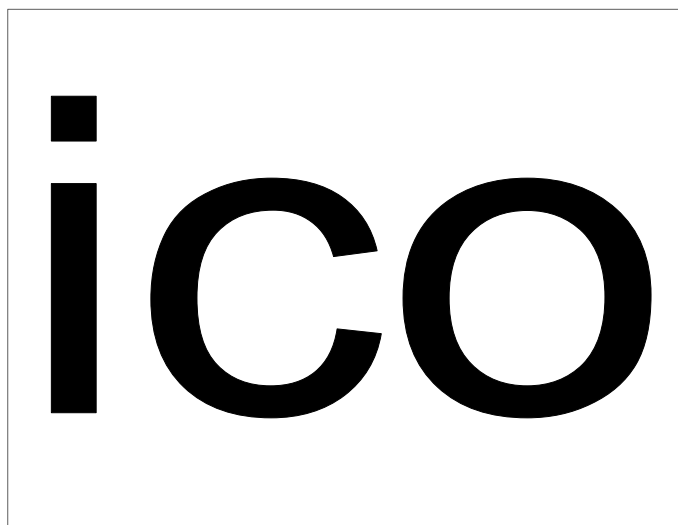
You'll see the ICO acronym on all correspondence.

During the early days of ICO we have primarily worked with the international student population at the University of Tulsa. Other schools located in