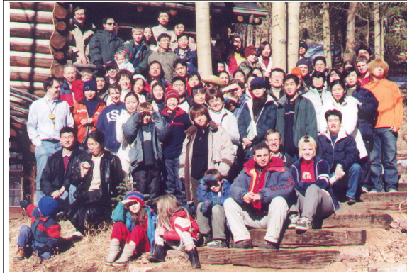
Students, staff, sponsors and children at this year's Bear Trap International House Party near Colorado Springs.

Of course in the grand scheme of things none of us have a clue as to how or why from God's perspective the U of A minister and family were unable to make the trip. What everyone does know is these students needed to experience the Colorado journey and to encounter some of the wonderful workings of the Holy Spirit there. All praise to